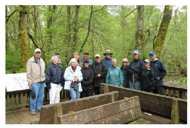
Walkers at the New Nisqually Wildlife Refuge Thursday Morning Walk, May 5, 2011