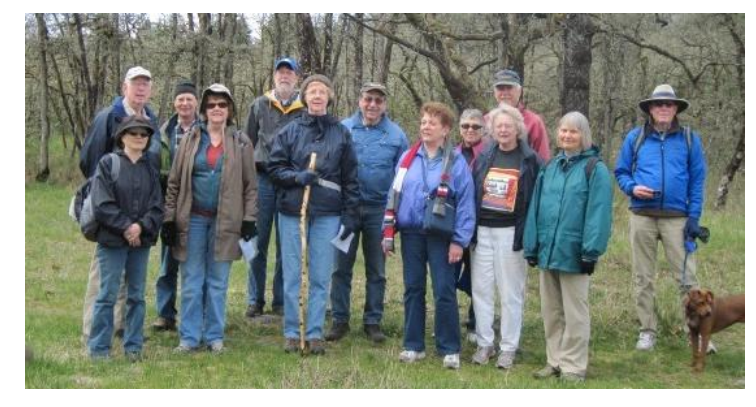
Walkers at Grand Mound/Scatter Creek Thursday Morning Walk, April 21,2011