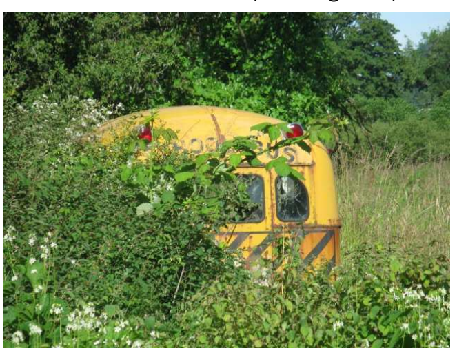
this is the trail to experience!

bales were basking in the sun. Some were already wrapped up in their giant "marshmallow" wrappers. At one point Bonnie pointed out where there is a view of Mount Rainier on a clear day. This was not a clear day! The entire trail is paved, so when you reach a main highway and gravel, you know it's time to turn around and retrace your steps. On the return trip, we saw people floating on inner tubes in the river and wished we were doing the same! This trail has future possibilities for being even longer than 10K, as there are plans to pave it all the way to Raymond. For a walk in the country change of pace,