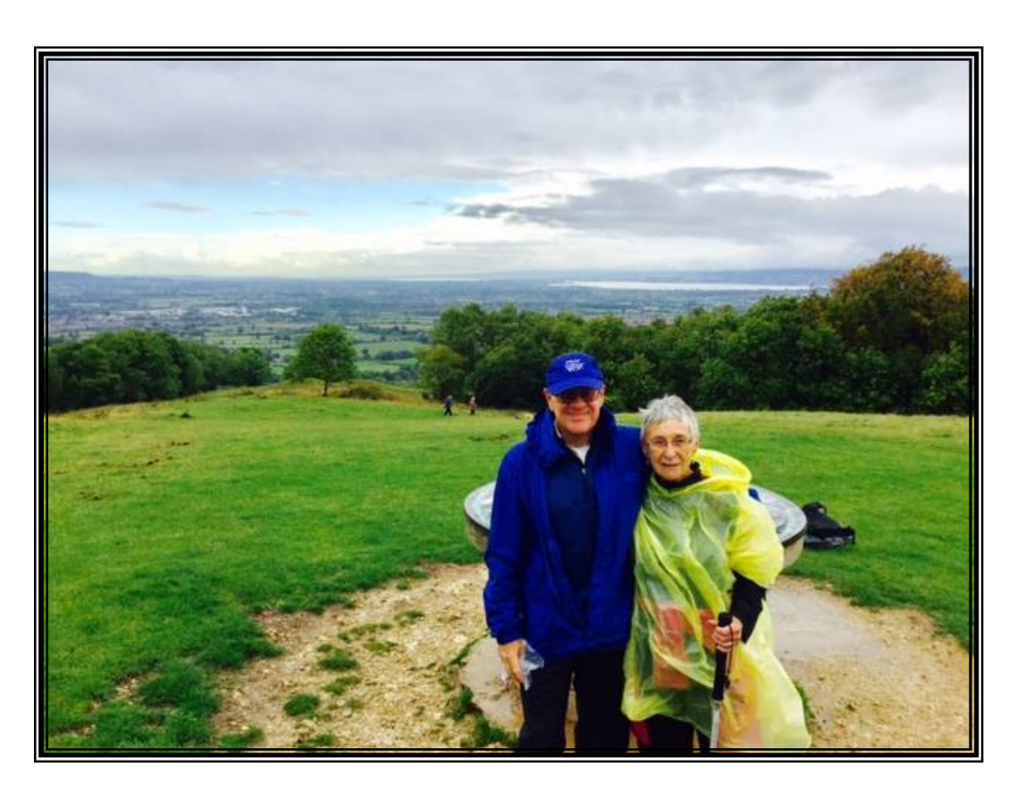
Morrisons in England, Cotswolds walk