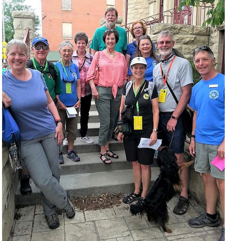
Downtown Billings Walk