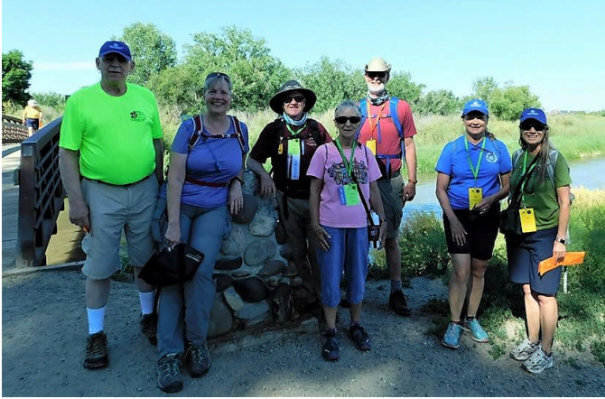
Yellowstone River Walk