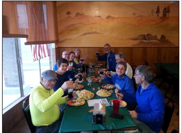
Hiking Weekend in Othello