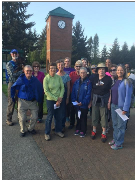
Tuesday Night Walk - Tumwater