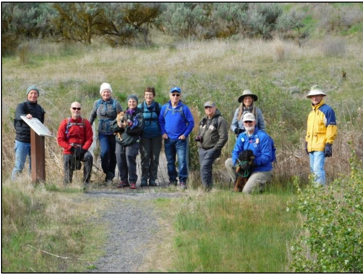
Hiking Weekend in Othello