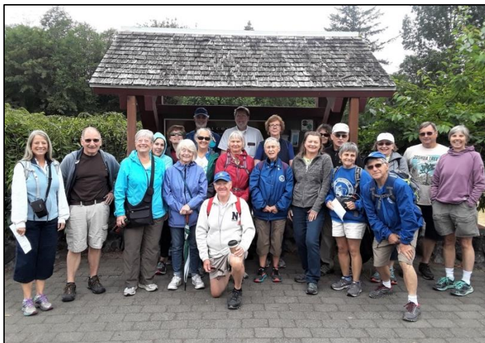
Thursday, June 28 Theler Wetlands Belfair, WA