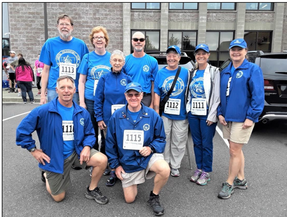
Saturday, June 30 th club members participated in a Boys & Girls Club 5k walk hosted by Thrive Community Fitness in Lacey.

Everyone wore their “colors” which generated a lot of interest from walkers and runners participating in this event.