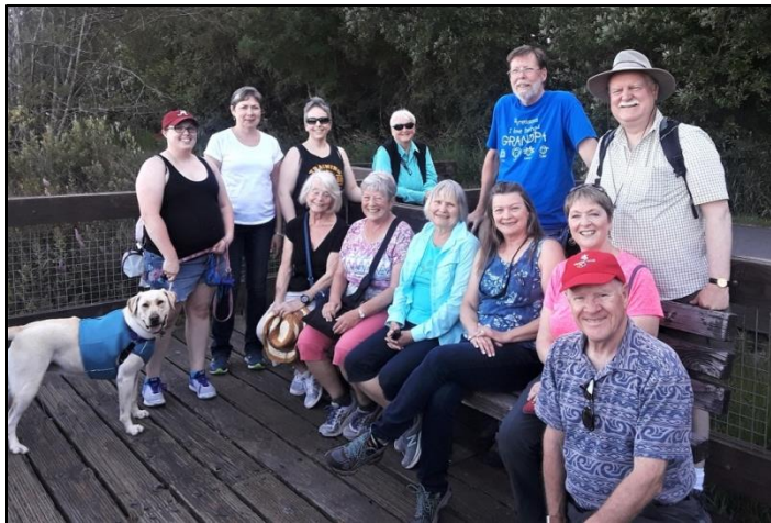
Tuesday, 22 June Chehalis Western Rail Trail Lacey, WA