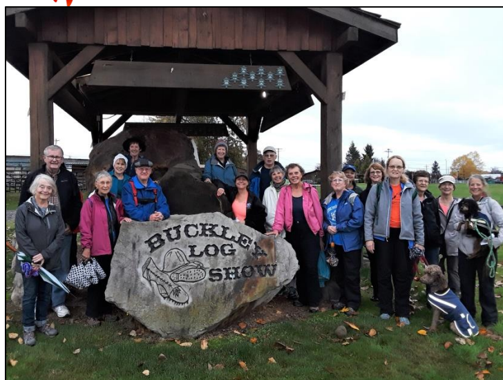
Left - November 1 st - Buckley, WA