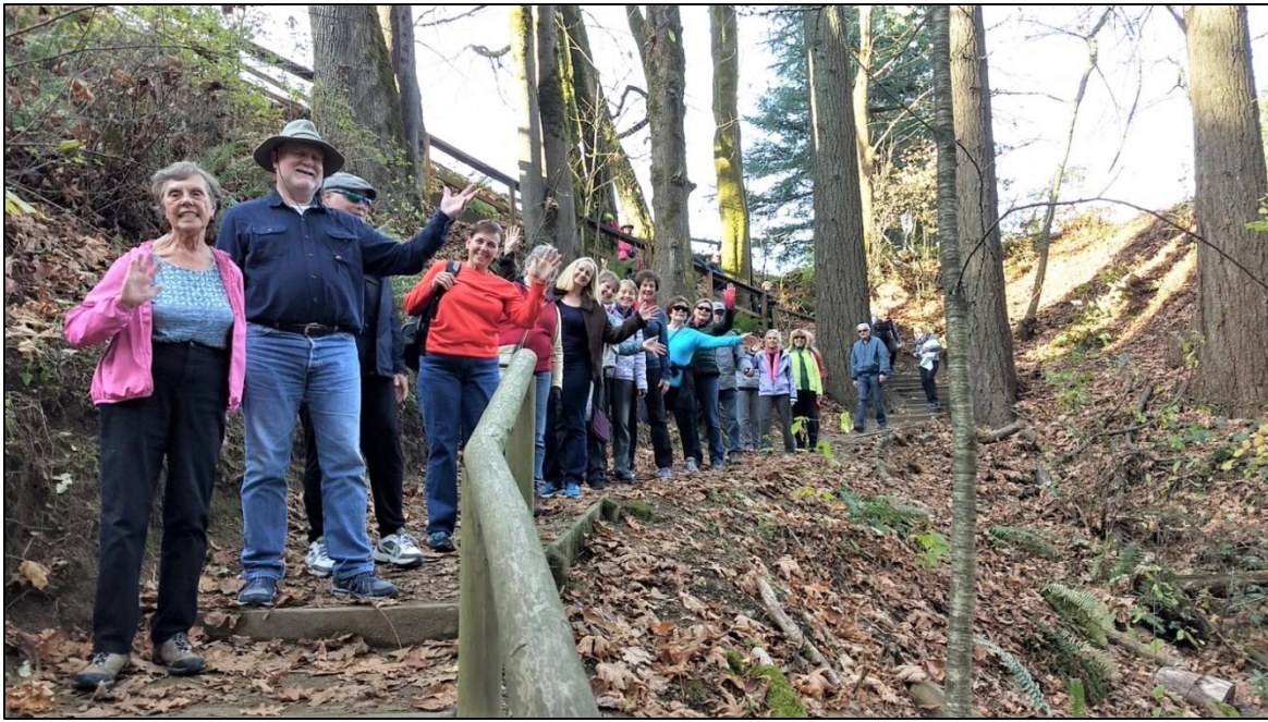
Left - Monday Walk - November 12 th Olympia, WA