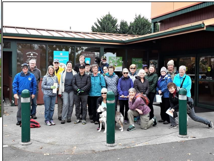
Right - November 8 th - Olympia, WA