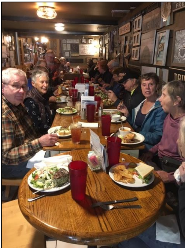
Left - Lunch after the walk on the Willipa Trail - YUM! November 30 th