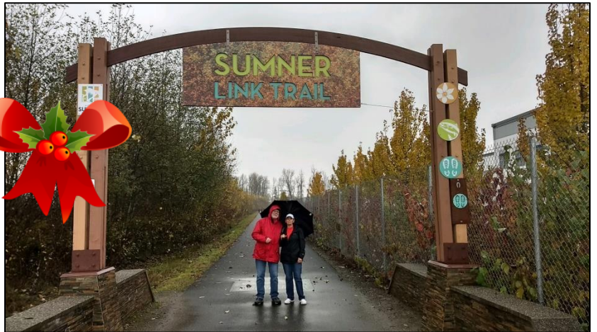
Right - November 23 rd - Opt Out Walk Sumner, WA