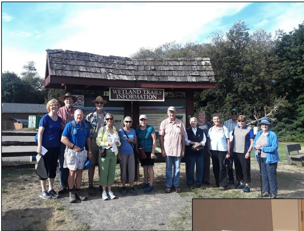
Theler Wetlands - Belfair September 5th