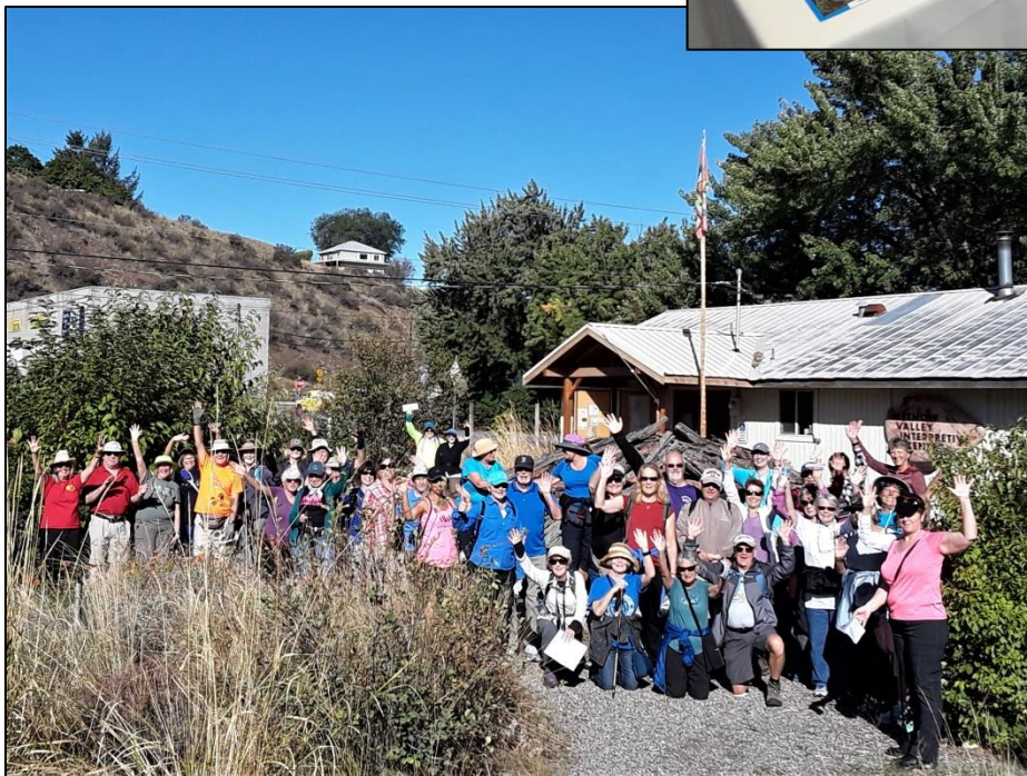
Group Walk in Twisp, WA Winthrop Walkers Roundup September 20-22 nd