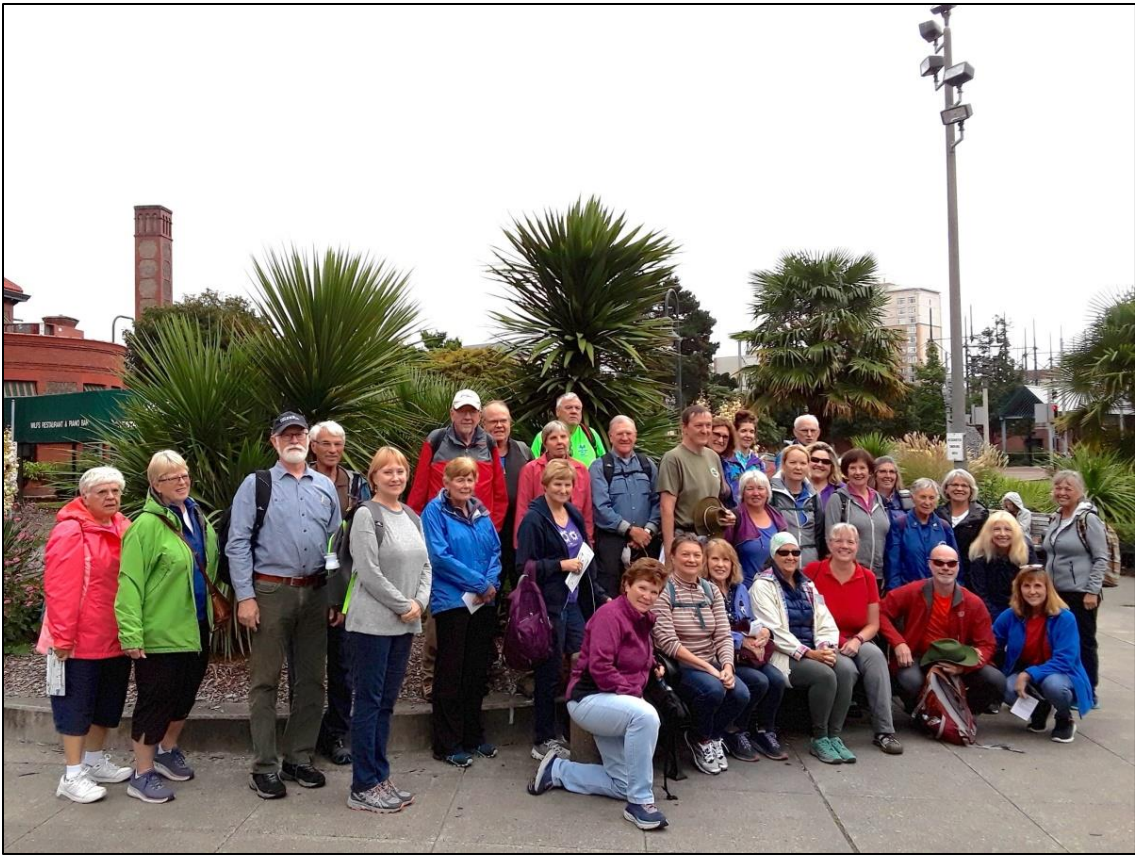
Train trip to Portland - Portland 5T Walk September 26th