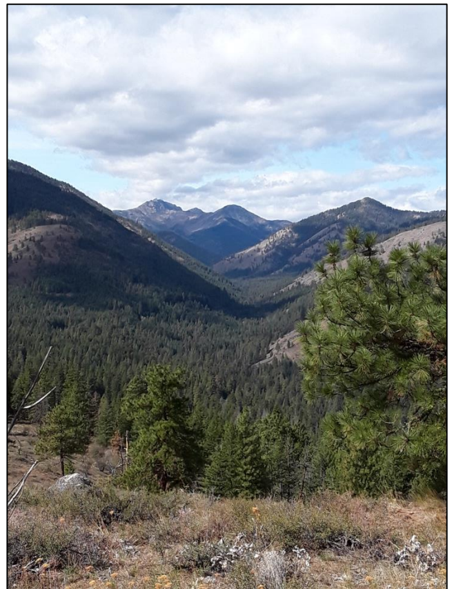
Walter Kraule Memorial Trail near Sun Mountain Lodge

Gratitude for the wonderful people I've met in my six years as a Volkssporter. I have friends who share my enjoyment of walking and hiking and who are so willing to share their beautiful places with others. They have drawn me to places and experiences I wouldn't have discovered without their generosity.