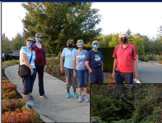
Left Last Tuesday Evening Walk