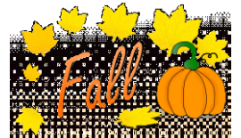
Below: Westside Hills Olympia