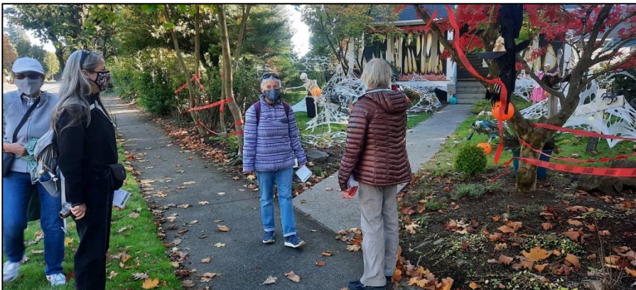
Monday October walk - Olympia

A BIG thank you to all of you who have sent me photos over the past 2 months! Since there was no newsletter in October, I have too many photos to put in one newsletter. Here are a few with where they were taken. Most were from September and October. Our club was busy this Fall! Good work walkers!