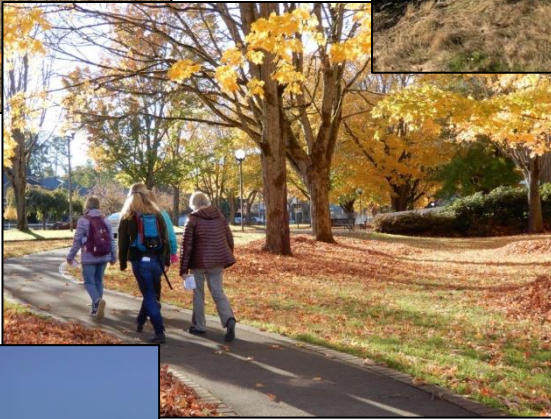
Left and Right: Monday Walks in Olympia