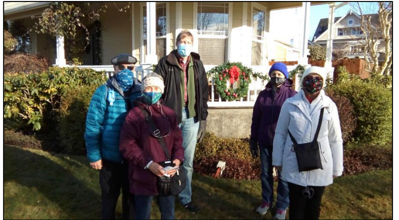
Above: Dupont Historic - December