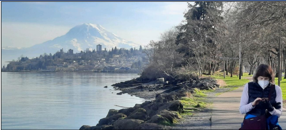
A nice winter day walk at Pt. Defiance, Tacoma