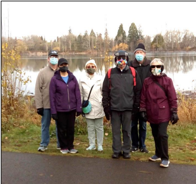
Left: Ft. Steilacoom December