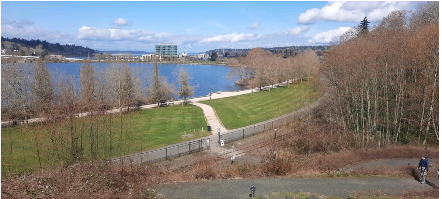
Switchback Trail is open again for walkers to enjoy.