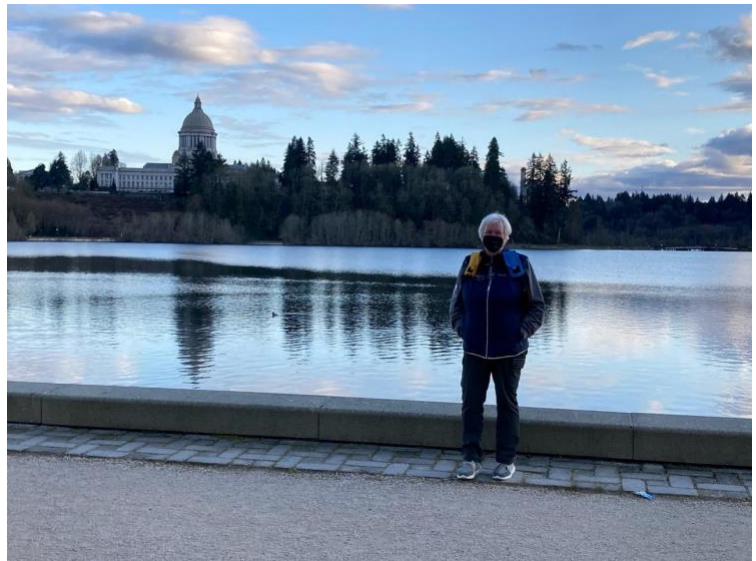
Beautiful Monday afternoon on Capitol Lake.