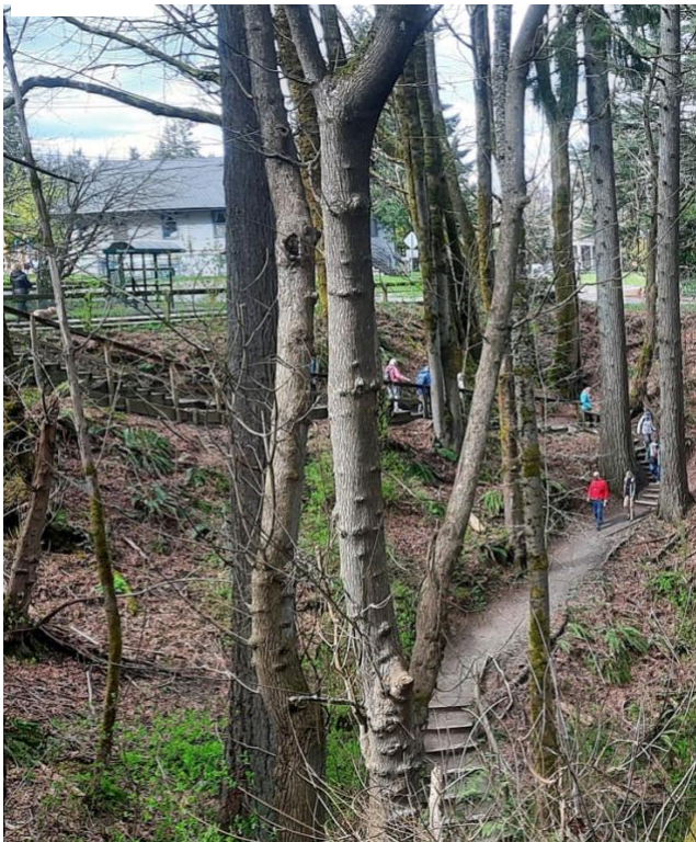
Monday walkers on the Garfield Nature Trail