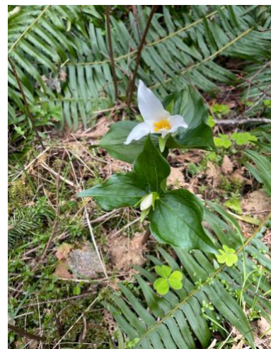
Springtime Trillium along the trail