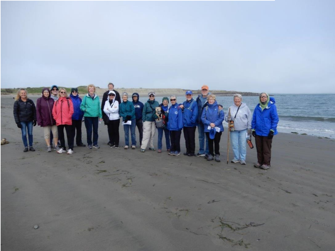
Fun at Westport