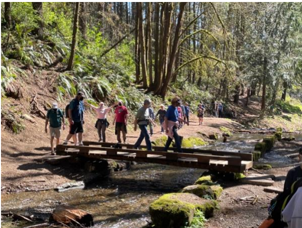
Photo of CVC walkers in Shelton on April 15, 2021