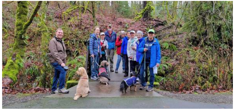
Des Moines Trail walkers with four-legged friends.