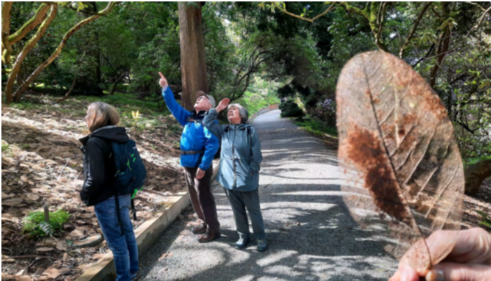
The Seattle Arboretum has lots to admire