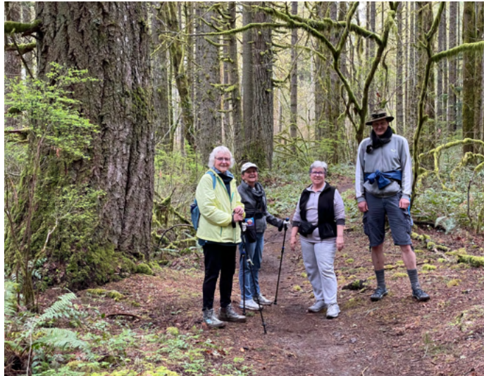
Mima Falls Trail walkers. The bear didn't register for the walk.