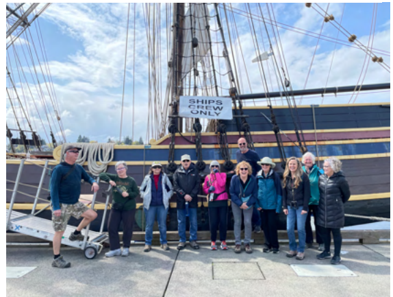
Olympia waterfront walkers enjoy historical ship