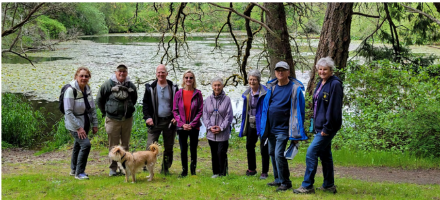
Springtime beauty in Spanaway