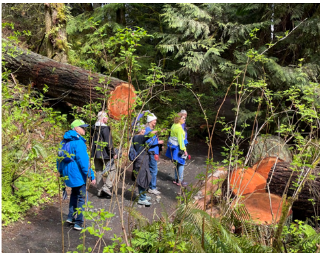
Lots of Mother Nature's wonders to admire in Watershed Park.

I have two doctors, my left leg and my right. — G. M. Trevelyan