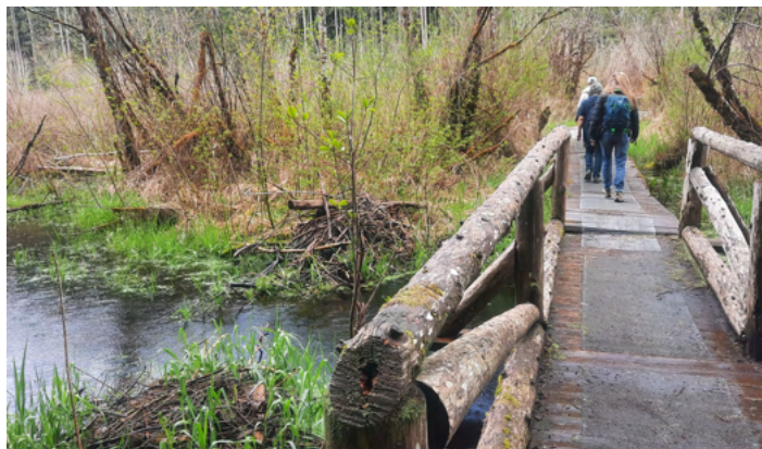
Millersylvania Walkers enjoying nature.