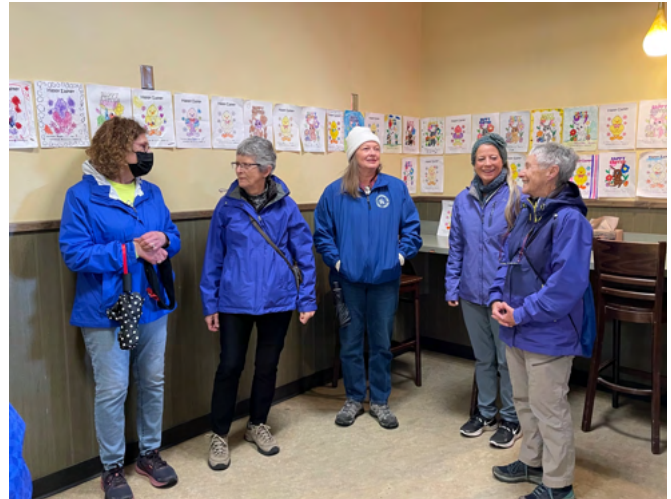
A pre-Wild & Woodsy walk in Tumwater brought together old friends.