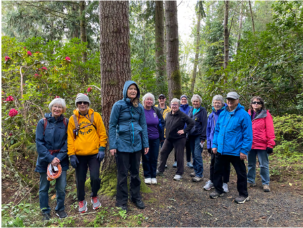
Five Friendly Parks