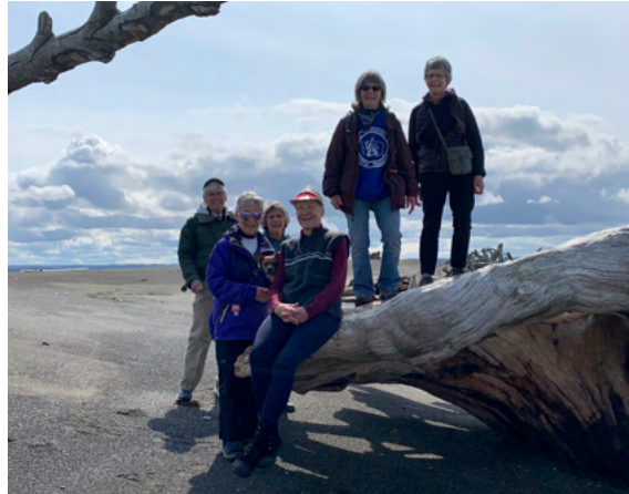
Damon Point walkers enjoy some coastal sunshine