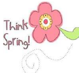
Point Defiance Park