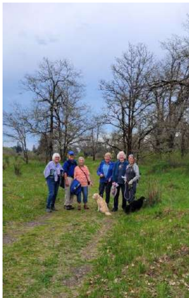
A lovely evening walk at Scatter Creek Prairie