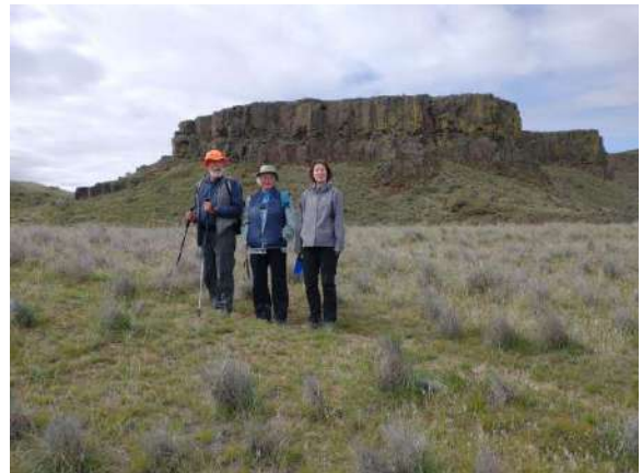
Othello event walkers appreciate the Eastern Washington landscapes.