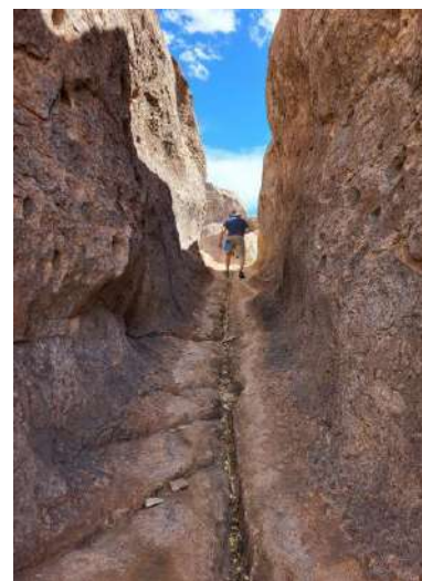
Tom Malone, City of Rocks

State parks start with the unusual City of Rocks (Grant County) with geologic formations up to 40 feet tall. One trail goes completely around the rocks and then invites you to wander through them. Another option is to hike up Table Mountain for the views. Farther south is Rockhound State Park (Luna Co) in the Little Florida Mts. Walk on trails or go off trail and collect and take some souvenirs. Don't miss the visitor center and displays.