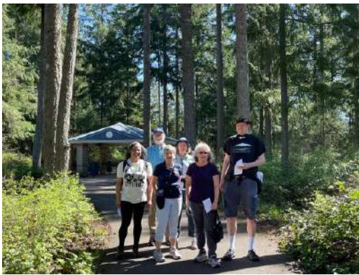
Earth Day walkers in Lacey.