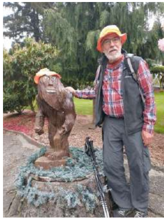
Hoquiam walkers take in views of Grays Harbor