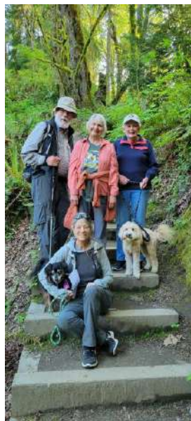
Beautiful Tuesday evening in Squaxin Park