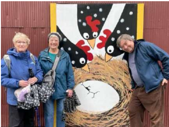
Smiling walkers in Winlock