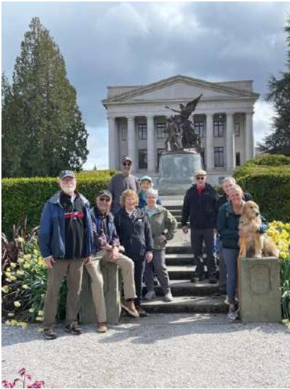
After April showers, walkers enjoy blue skies & blooms around the capitol