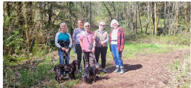
Sunny skies shine on Tenino walkers