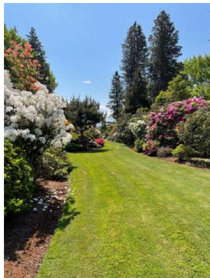
Enumclaw walkers enjoyed a beautiful walk that included the Anderson Rhododendron Garden.