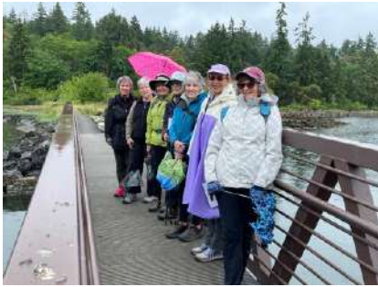
Bainbridge Island walkers braved the rain!