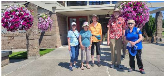
Walkers enjoy a new walking option: Sunday afternoon in Lacey