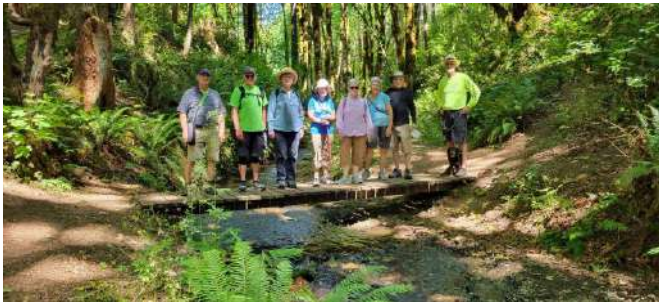
Shelton walkers enjoy the shady creek trail