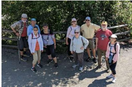
Walkers enjoy Tumwater Falls and rose garden