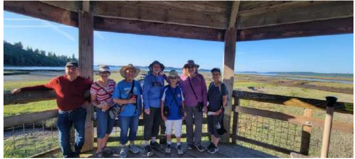
Tuesday night at Billy Frank Nisqually Wildlife trail.