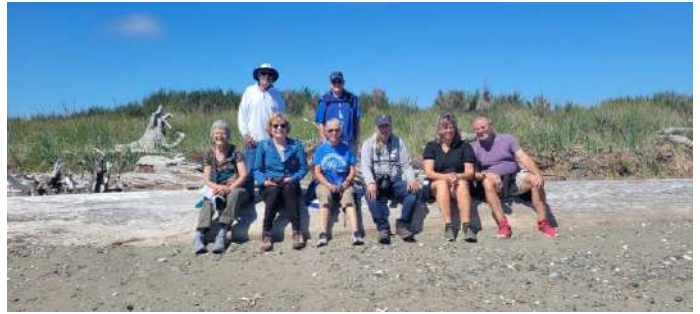
Sunny skies at Damon Point