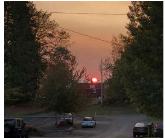
Here's a picture of smoky Olympia in 2020.

Please join us for the Anderson Island Walk (see the Pathfinder) on Aug. 5 and our CVC picnic at Millersylvania State Park on Aug. 10. Details about our picnic will be in this newsletter.