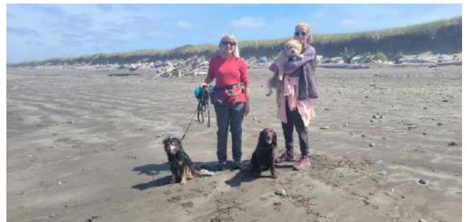
The Westport beach offers fun for all