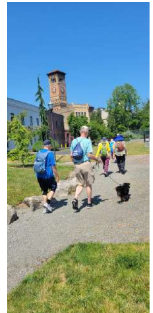
Tacoma walkers tackle another hill