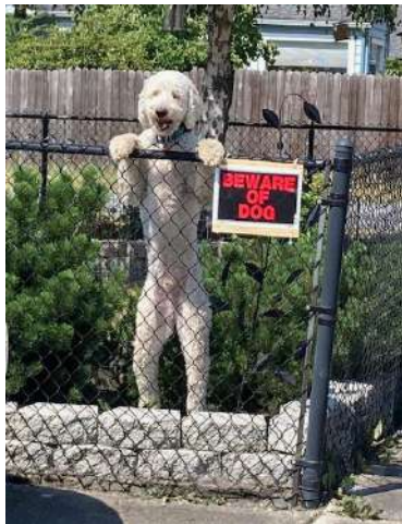
Eatonville pooch greets walkers with a smile