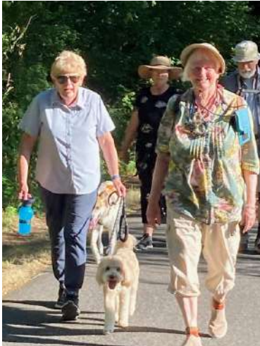
A long summer day means a beautiful Tuesday night walk on the Chehalis-Western Trail