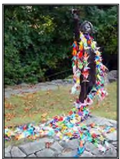
Bronze statue of Sadako Sasaki

After registering at the Fisheries Supply store, start and finish point, we were heading downhill to Northlake Way to Pacific Street and NE 40<sup>th</sup> Street passing "Peace Park and