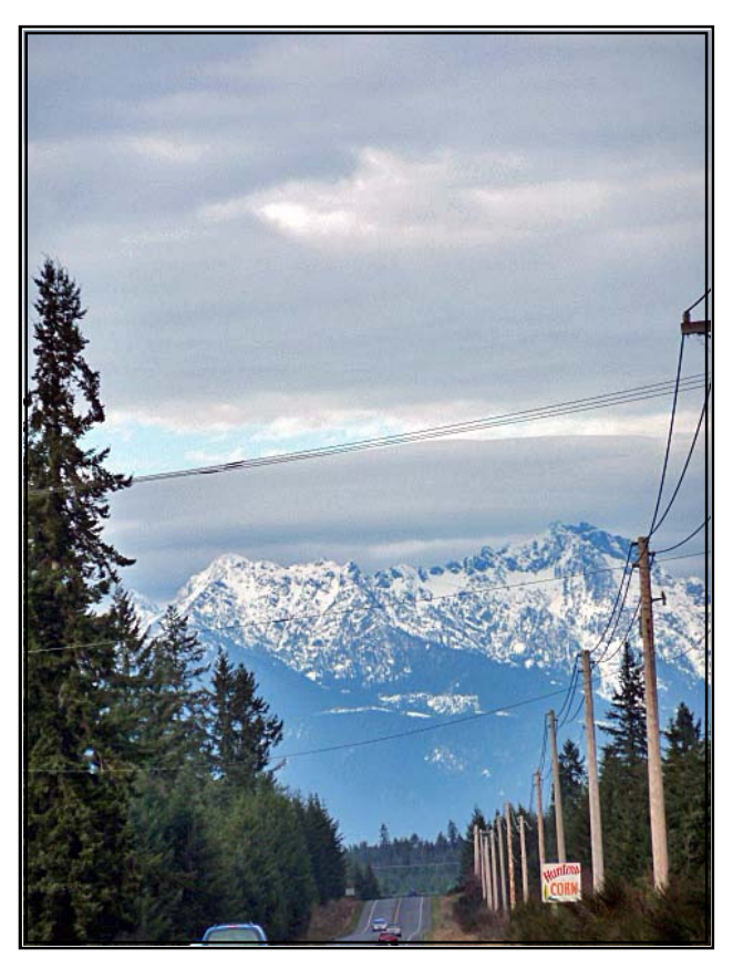
Olympic Mountain Range