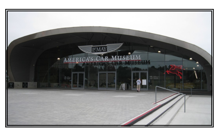
Tacoma City walk

The 2014 conference is now being planned by OTSVA for downtown Portland, Oregon.