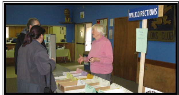
Which walk shall we do first...