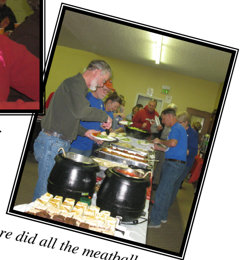
Where did all the meatballs go...