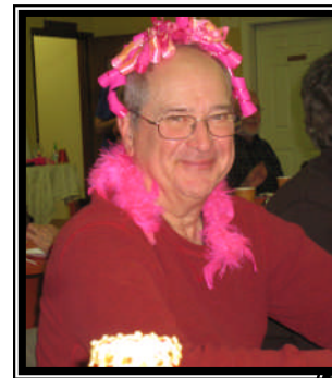
Ready to party....