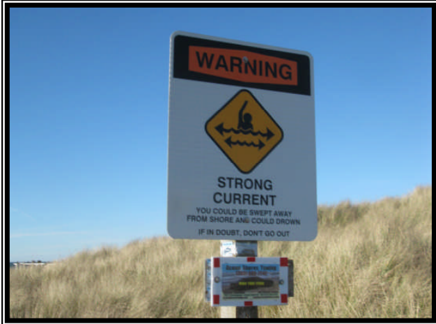
Don't mess with the ocean...

Home baked cookies, delicious homemade soups, hot coffee, smiles and more smiles—all provided the extras, which people have come to expect, when CVC puts on an event. When it became apparent people wanted group walks,