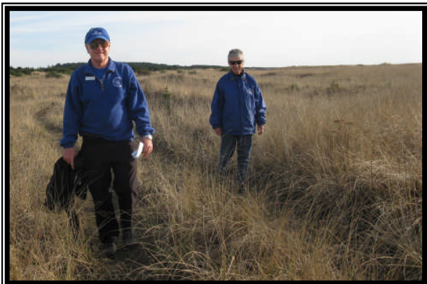
Looking for arrows at Griffiths-Friday