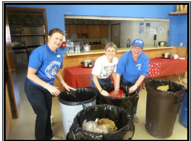
End of the party!