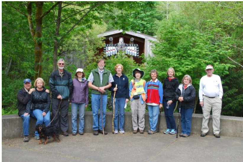
Walkers at Evergreen Colledge