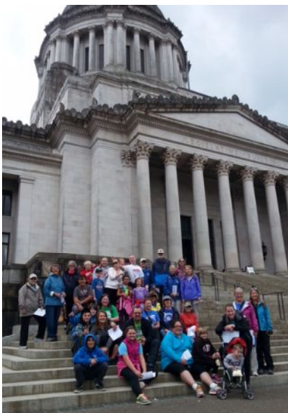
Girl Scout Walk