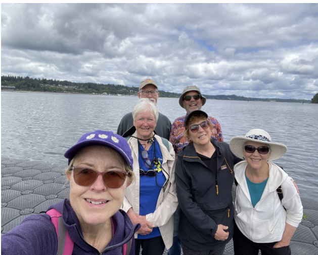
Olympia Waterfront—June 24, 2024