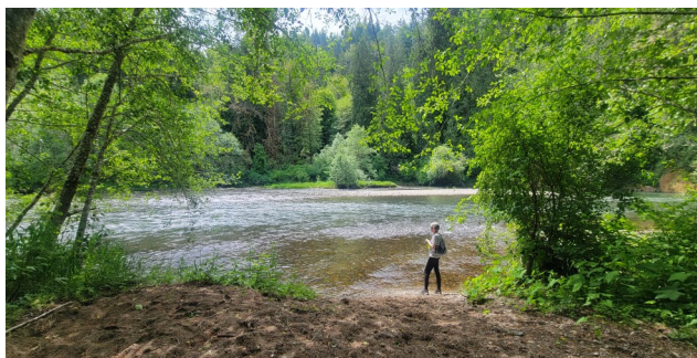
Nisqually State Park—June 8, 2024