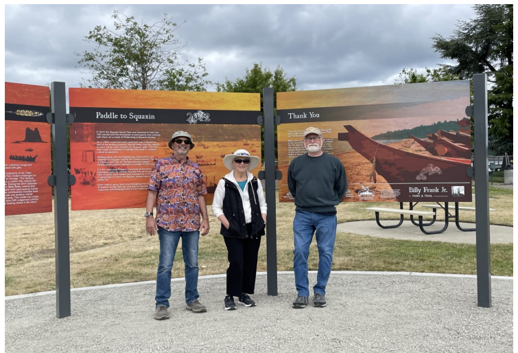
New signage along the Olympia Waterfront for the Billy Frank Trail and the Paddle to Squaxin—June 24, 2024