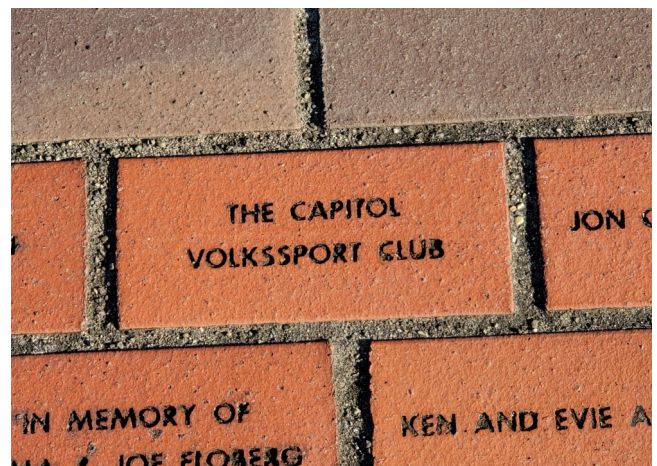
Commemorative brick at the Lacey Amtrak station showing CVC's contribution to the station's building fund—June 20, 2024