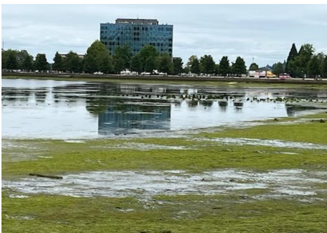
Low Capital Lake with visible pilings seen on Capital walk— July 22, 2024