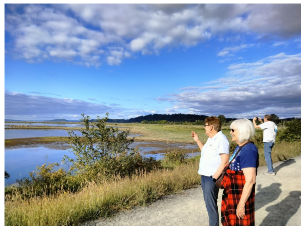
Nisqually 5K Walkers—July 2, 2024