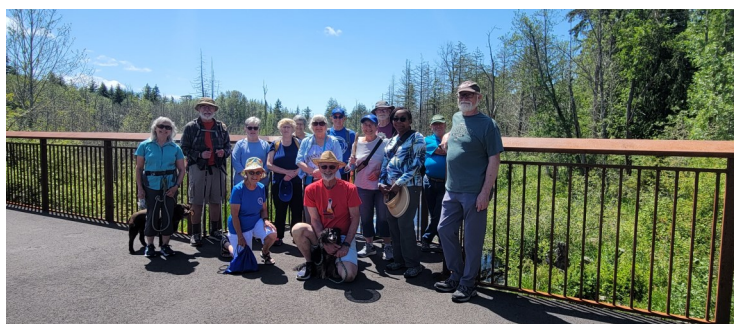
Sunday afternoon on the Chehalis-Western Trail—June 9, 2024