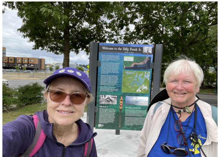
Olympia Waterfront—June 24, 2024