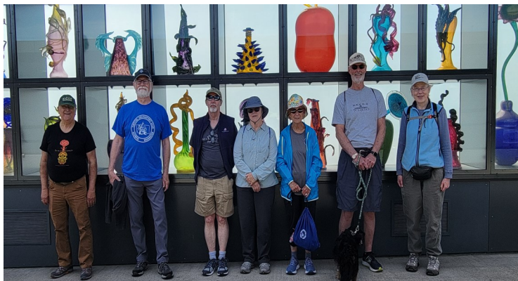
Downtown Tacoma Walk—June 6, 2024