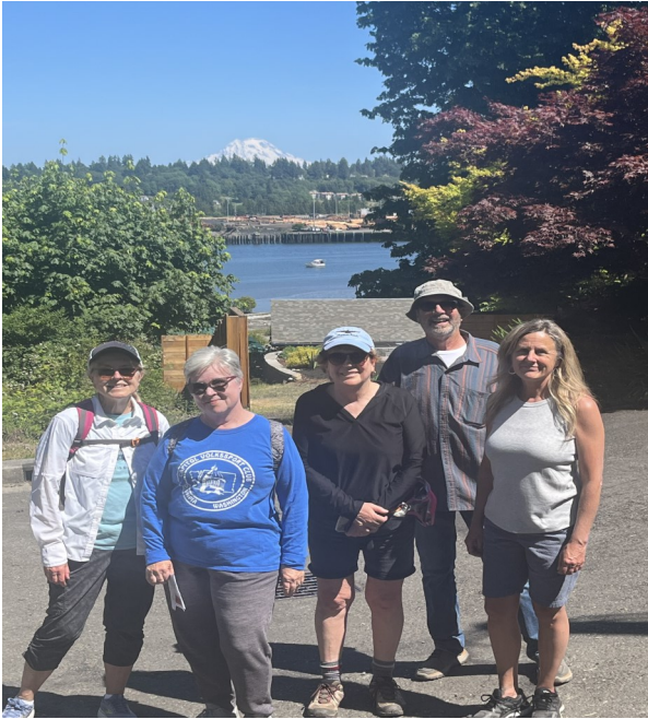
Westside Walk from Bayview—June 10, 2024