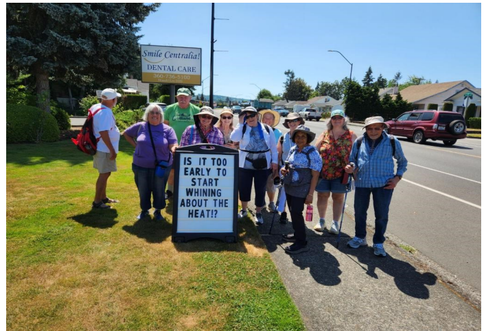
Centralia "Sign Says It All"—July 10, 2024