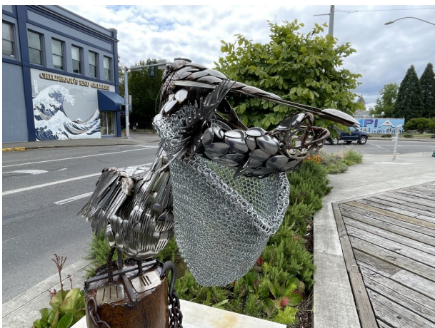
Olympia Waterfront—June 24, 2024