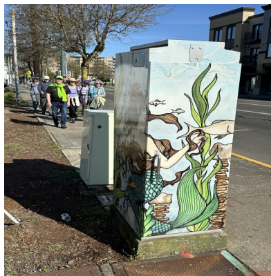
Proofing Pub Crawl Walk