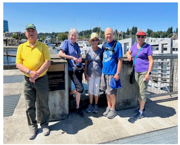
Enjoying the Olympia Waterfront— July 11, 2024