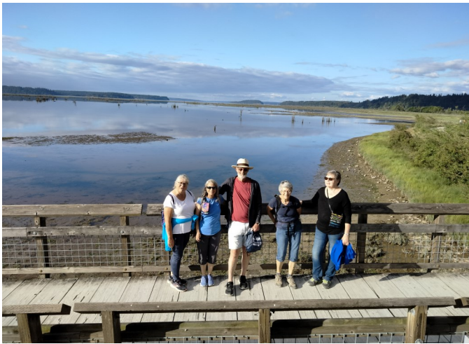
Nisqually 10K Walkers—July 2, 2024