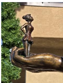
1- Tinker Bell (fairy) in Boulder City

From Palm Springs we moved to Las Vegas for a 1½ months. Once again great weather with a few windy days. Walked the Strip numerous times as well as all the other Las Vegas High Rollers and Stroller (LVHRS) YREs. Still lots of construction going on – especially with the new Hard Rock Resort! As usual, lots of people-watching on the Strip!