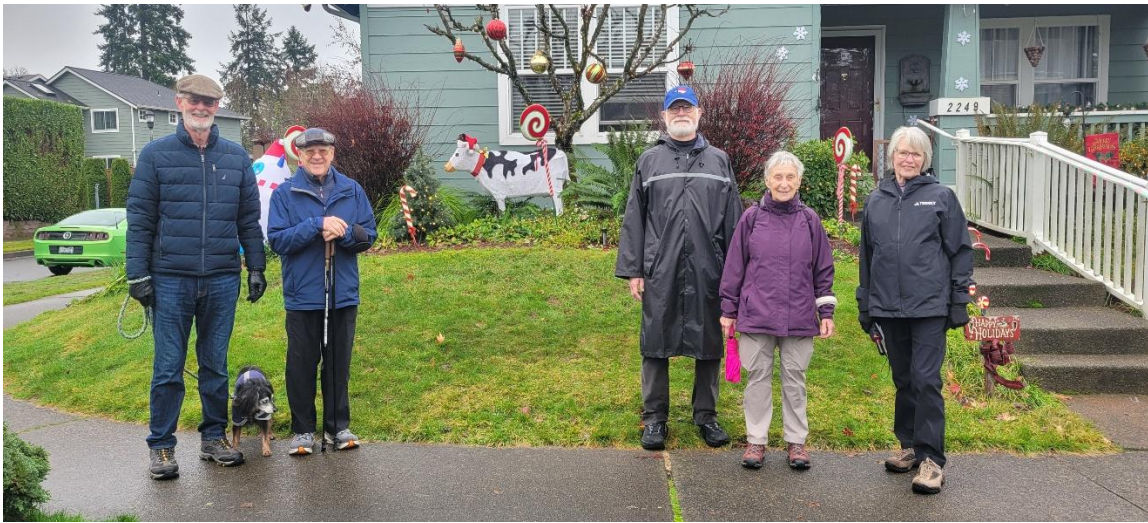
DuPont Walk 12-11-25