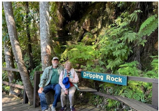
President's message continued - Page 2