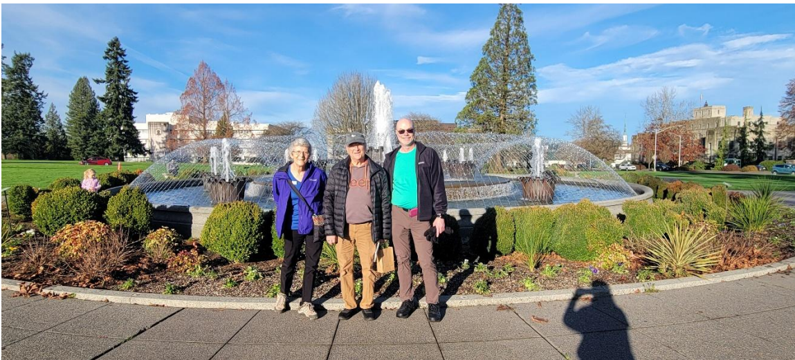
Holiday Walk 12-13-25