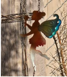
2 - Fairy in Lake Havasu Rock Garden

sufficient as folks came and went and only occasionally did we all run into each other. The club also had some of their YRE PSBs at the event which many took advantage of making plans to walk together. Many photos posted of the local YREs as well as those from the North and South Las Vegas Strip trails on Facebook. Next 50 th Anniversary Signature Event is the TTR with Friday's walk in Fredericksburg TX where it all began!