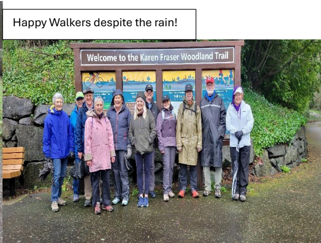
Happy Walkers despite the rain!