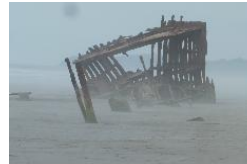
Wreckage of the Peter Iredale-Hammond