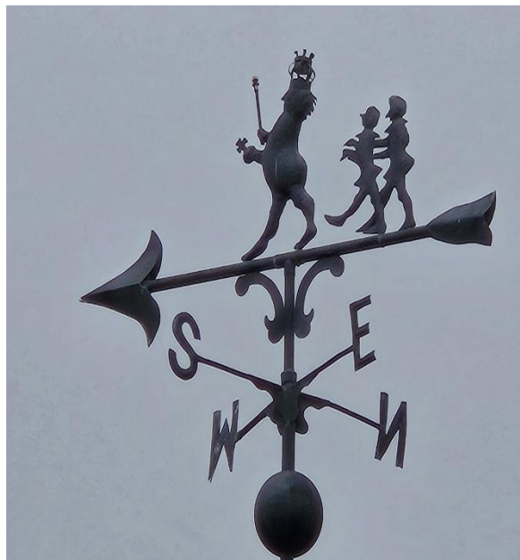
Solvang CA - Hans Christian Anderson inspired wind vane