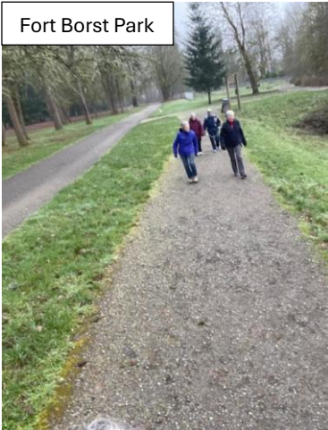
Fort Borst Park