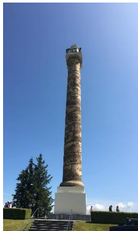
The Astoria Column