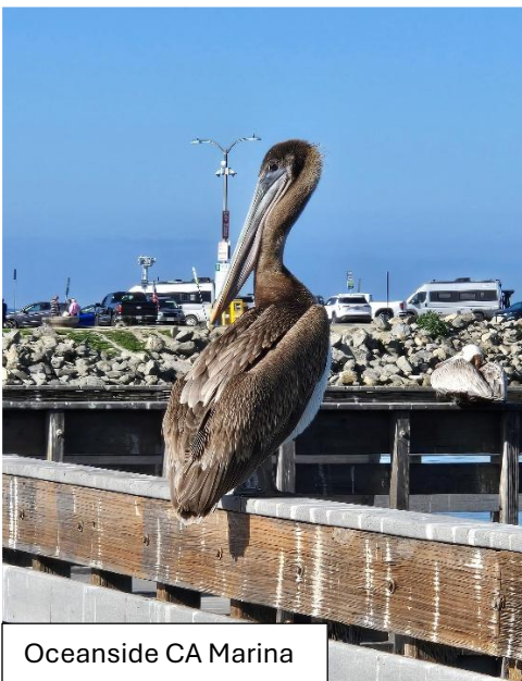
Oceanside CA Marina