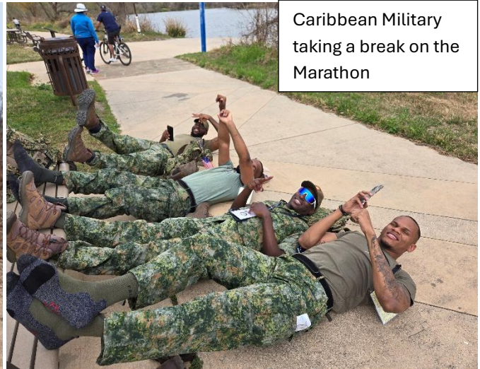
Caribbean Military taking a break on the Marathon