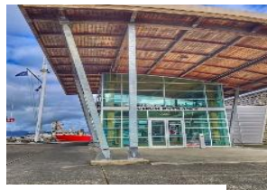
Columbia River Maritime Museum